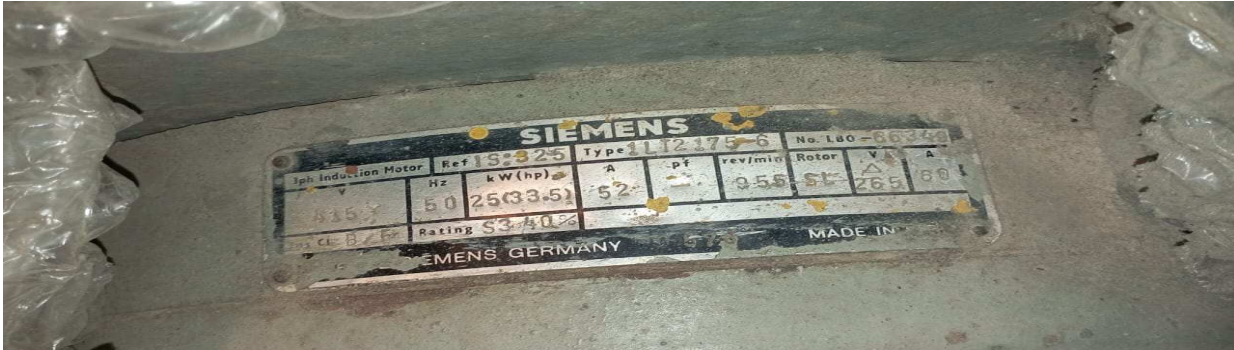
Figure 1 Motor Name Plate

LT uses two numbers of slipping ring induction motors of 25 KW, 985 rpm, 52 Amps, Rotor Voltage 265V, Rotor Current 60Amps, Stator Insulation Class B, Rotor Insulation Class F, Frame size 135 (Figure 1) and Siemens SIMOTRAS HD 285 Amps drive for the control. Control Voltage is 230V, 1 Ø, 50 Hz. For Drive electronics 180V, 1 Ø, 50 Hz is used. Single line diagram of the present drive is as follows (Figure 2)